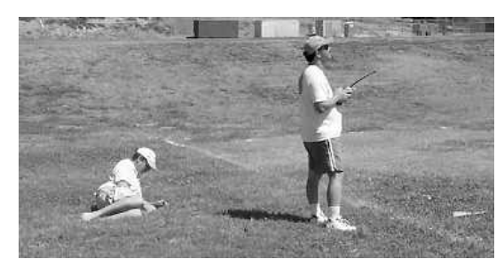
Above:- Pilot's meeting. At the time of writing there's no pictures of the winners......YHEditor was over at the landing area for most of the contest, but he did snap a couple of interesting pix

Right:- Here we see a timer diligently counting down the seconds as the pilot lines up the plane for a landing (well, it was a BoT he was timing for so maybe landing precision needn't be taken too serioulsy)