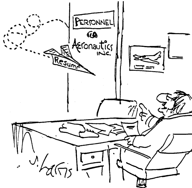
"Whoever you are, you're hired."