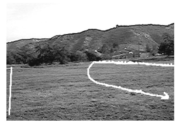
Paramount Ranch showing approximate line of the

Ron Brown (310) 328-8684 Brian Iten (310) 322-5860