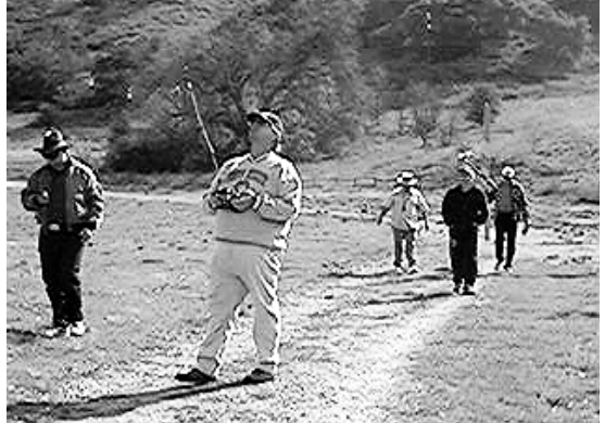
the Scooter EPP Electric