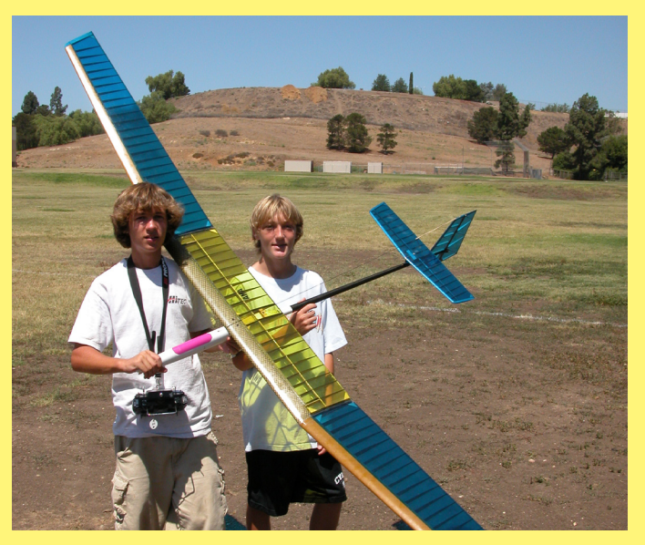
Some of da uder yout's