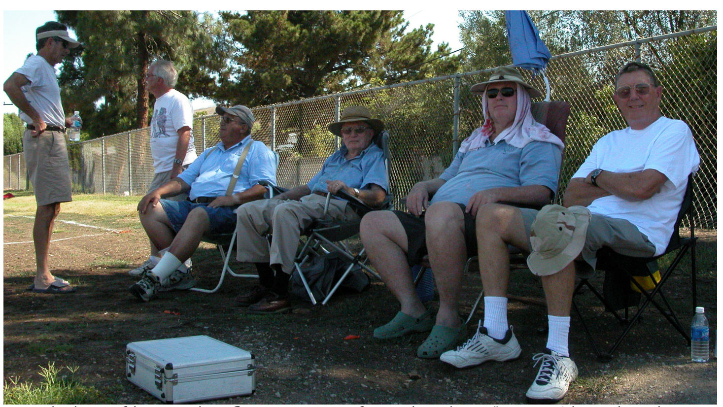
In the heat of last Sundays flying. our team of top pilots discus "Hot Air Thermals" in heat.

AMATEUR RADIO FREQ.: 02, 05, 08, 09, 53.4, 53.5.